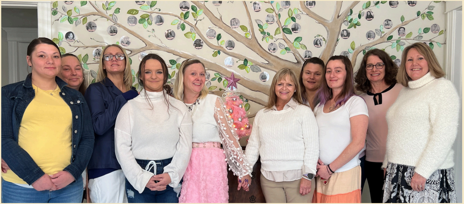
Handpainted Mural in the Wings of God Women's Home Dining Room - 125 Pearls)