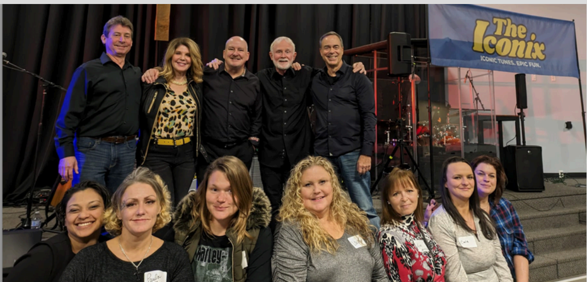
Wings of God Benefit Concert with the Iconix band.