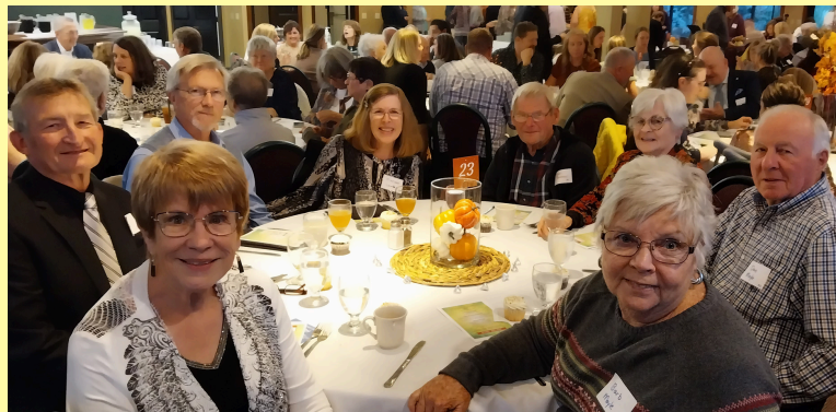
SAVE THE DATE: Fall Benefit Dinner Oct. 17, 2024

The 2023 Wings of God Benefit Dinner was a huge success. The Pearls were so brave and their testimonies nothing short of amazing. God blessed us with over $32,000 given toward the event! Wings of God could not be who we are without God's people saying yes to supporting the mission. Thank you so much for your generous gifts.