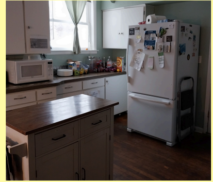
Before (above) and After (below)

Since our opening in 2012, this 50-year-old kitchen has served as the heart of the home to 118 Pearls. It has been well-loved and well-used, but it was time for a refresh and it is very exciting! The kitchen remodel is about 95% done. Over 35 amazing people brought a dinner (or two) for the Pearls during the remodel — so helpful while there was no working stove or sink. Stay tuned, as we will announce an Open House soon so you can tour the new kitchen. And surprise — the hallway entry, living room, dining room, and downstairs bathroom received a refresh as a bonus! One of the Pearls commented upon seeing the new downstairs - "everything is so elegant!"