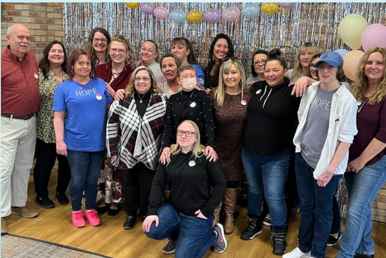
10th Birthday Party held at Freshwater Community Church on April 9, 2022 – Photo of Board Members, Staff, Current & Previous Pearls