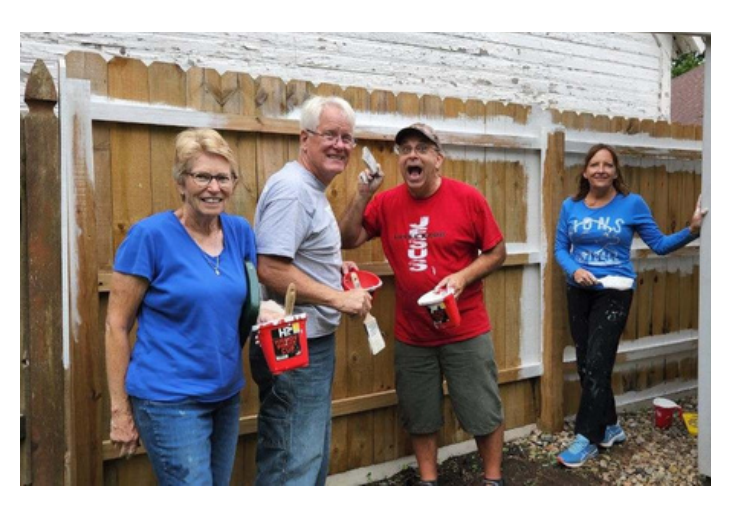
Volunteers from Renovation Church priming our recently installed new fence. There are quarterly yard maintenance volunteer opportunities. Groups are welcome!