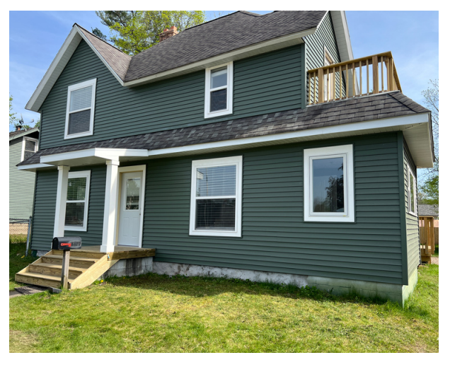
This home is a dream come true!

This home will be used exclusively for Pearls who have benefited from the Wings of God program and have custody or visitation of their minor children. By virtue of a $150,000 donation from a generous family, this home is PAID IN FULL and is DEBT-FREE. Praising God, through the Welcome Home Capital Campaign donations, all of the repairs and improvements were completed.